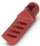
Coding profile for HC-MOD-K... housing