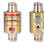
Lightning Arrestor LABH350NN (Sold Separately)