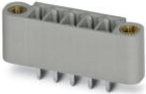
The figure shows the 5-pos. version of the product in gray

Header, Nominal current: 8 A, Rated voltage (III/2): 160 V, Number of positions: 11, Pitch: 3.5 mm, Color: black, Contact surface: Tin, Mounting: Wave soldering