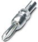
Test plugs, Color: silver