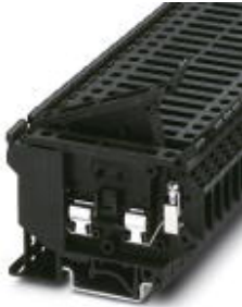
Fuse terminal block for cartridge fuse insert, cross section: 0.2 - 4 mm 2 , AWG: 26 - 10, width: 8.2 mm, color: Gray

Please be informed that the data shown in this PDF Document is generated from our Online Catalog. Please find the complete data in the user's documentation. Our General Terms of Use for Downloads are valid ( http://download.phoenixcontact.com )