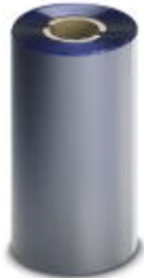
Ink ribbon, Length: 300000 mm, Width: 110 mm, Color: blue

Please be informed that the data shown in this PDF Document is generated from our Online Catalog. Please find the complete data in the user's documentation. Our General Terms of Use for Downloads are valid ( http://download.phoenixcontact.com )