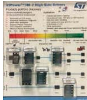
M0-7 sample kits