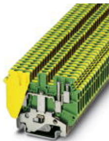
1-level ground modular terminal block with double connection on both sides, cross section: 0.2 - 2.5 mm 2 , width: 5.2 mm, color: green-yellow

Please be informed that the data shown in this PDF Document is generated from our Online Catalog. Please find the complete data in the user's documentation. Our General Terms of Use for Downloads are valid ( http://phoenixcontact.com/download )