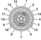
Connector pin assignment