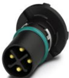
Flush-type connector, Universal, 4-position, Plug, straight, S power, PCB mounting, THR solder connection

Please be informed that the data shown in this PDF Document is generated from our Online Catalog. Please find the complete data in the user's documentation. Our General Terms of Use for Downloads are valid ( http://phoenixcontact.com/download )