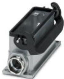
Box mounting base, with single locking latch, height 67 mm, with screw connection, 1x M25

Please be informed that the data shown in this PDF Document is generated from our Online Catalog. Please find the complete data in the user's documentation. Our General Terms of Use for Downloads are valid ( http://phoenixcontact.com/download )