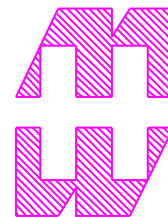
VIEW LID (INSIDE)