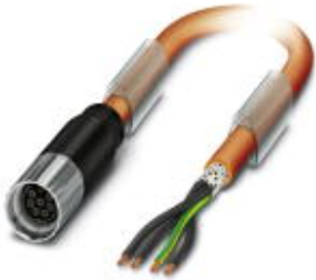
Cable plug in molded plastic, Length: 5 m, Color of outer sheath: orange RAL 2003

Please be informed that the data shown in this PDF Document is generated from our Online Catalog. Please find the complete data in the user's documentation. Our General Terms of Use for Downloads are valid ( http://phoenixcontact.com/download )