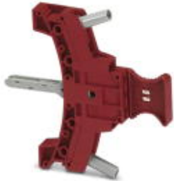
Test plug, Number of positions: 1, Width: 9 mm, Color: red

Please be informed that the data shown in this PDF Document is generated from our Online Catalog. Please find the complete data in the user's documentation. Our General Terms of Use for Downloads are valid ( http://phoenixcontact.com/download )