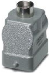
HEAVYCON B6 sleeve housing, for single locking latch, height: 56 mm, with 1 x Pg13.5 gland, straight cable outlet

Please be informed that the data shown in this PDF Document is generated from our Online Catalog. Please find the complete data in the user's documentation. Our General Terms of Use for Downloads are valid ( http://download.phoenixcontact.com )