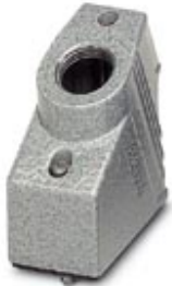
Powder-coated sleeve housing, with metric cable entry, locking screws with cylinder head

Please be informed that the data shown in this PDF Document is generated from our Online Catalog. Please find the complete data in the user's documentation. Our General Terms of Use for Downloads are valid ( http://phoenixcontact.com/download )