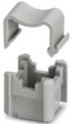
Support bracket for busbars

Please be informed that the data shown in this PDF Document is generated from our Online Catalog. Please find the complete data in the user's documentation. Our General Terms of Use for Downloads are valid ( http://phoenixcontact.com/download )