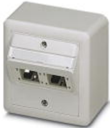
Terminal outlet, surface mounting, IP20, two slots for contact inserts with the Freenet system

Please be informed that the data shown in this PDF Document is generated from our Online Catalog. Please find the complete data in the user's documentation. Our General Terms of Use for Downloads are valid ( http://phoenixcontact.com/download )