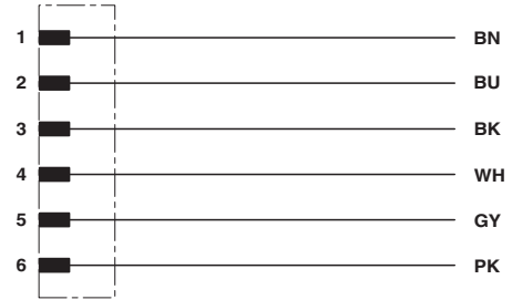
Contact assignment of the DEUTSCH DT04-6P