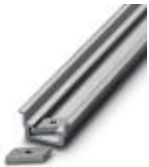
DIN rail, deep drawn, high profile, unperforated, 1.5 mm thick, material: aluminum, height 15 mm, width 35 mm, length 2000 mm

DIN rail, unperforated - NS 35/15 AL UNPERF 2000MM - 1201756