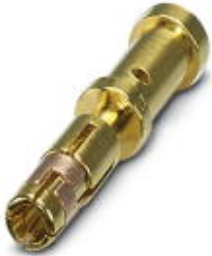
Crimp contact, turned, contact diameter: 1 mm, crimp range: 0.5 mm 2 ... 1 mm 2

Please be informed that the data shown in this PDF Document is generated from our Online Catalog. Please find the complete data in the user's documentation. Our General Terms of Use for Downloads are valid ( http://phoenixcontact.com/download )