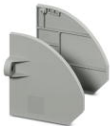
Flange cover, Number of positions: 0, Color: gray

Please be informed that the data shown in this PDF Document is generated from our Online Catalog. Please find the complete data in the user's documentation. Our General Terms of Use for Downloads are valid ( http://phoenixcontact.com/download )