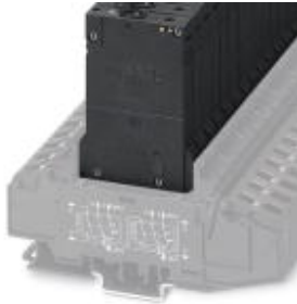
Thermomagnetic circuit breaker, 2-pos., normal blow, 1 N/O contact and 1 N/C contact

Please be informed that the data shown in this PDF Document is generated from our Online Catalog. Please find the complete data in the user's documentation. Our General Terms of Use for Downloads are valid ( http://phoenixcontact.com/download )