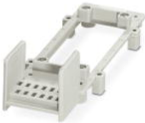
Connector holder for connector mounting plate, with strain relief, for inserting contact inserts, type HC-B 16

Please be informed that the data shown in this PDF Document is generated from our Online Catalog. Please find the complete data in the user's documentation. Our General Terms of Use for Downloads are valid ( http://download.phoenixcontact.com )