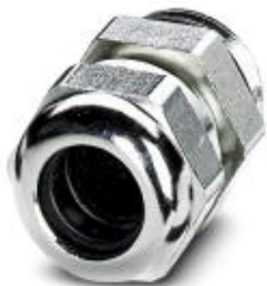
Cable gland, shielded: No, Cable diameter: 9 mm...13 mm

Please be informed that the data shown in this PDF Document is generated from our Online Catalog. Please find the complete data in the user's documentation. Our General Terms of Use for Downloads are valid ( http://phoenixcontact.com/download )