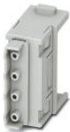
Contact insert module, number of positions: 4, Socket V, application: FO, with 4 ceramic ferrules

Please be informed that the data shown in this PDF Document is generated from our Online Catalog. Please find the complete data in the user's documentation. Our General Terms of Use for Downloads are valid ( http://phoenixcontact.com/download )