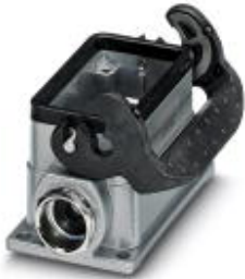
Box mounting base, with single locking latch, height 52 mm, with screw connection, 2x Pg16

Please be informed that the data shown in this PDF Document is generated from our Online Catalog. Please find the complete data in the user's documentation. Our General Terms of Use for Downloads are valid ( http://phoenixcontact.com/download )